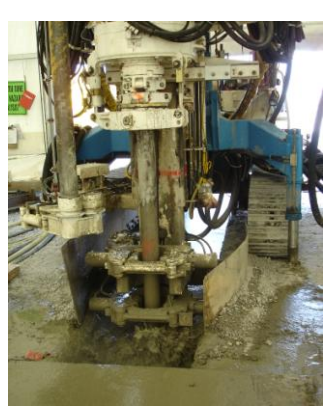
JET GROUTING DETAIL