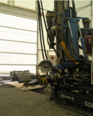
WINTER WORK IN TENT